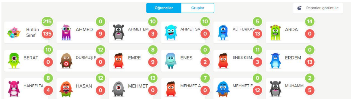
Figure 2. Giving feedback to students

Class Dojo is a software that allows students and their parents follow the activity levels in the classroom using fun avatars. Giving feedbacks and own fun avatars selected by students are shown in Figure 2.